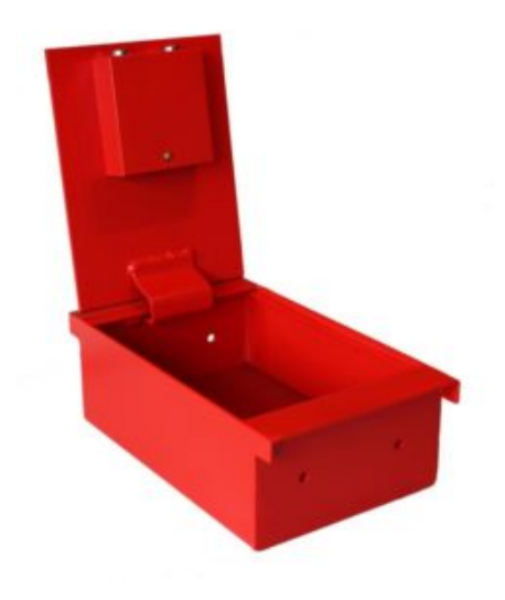
Strongbox Extra Euro Profile Lock